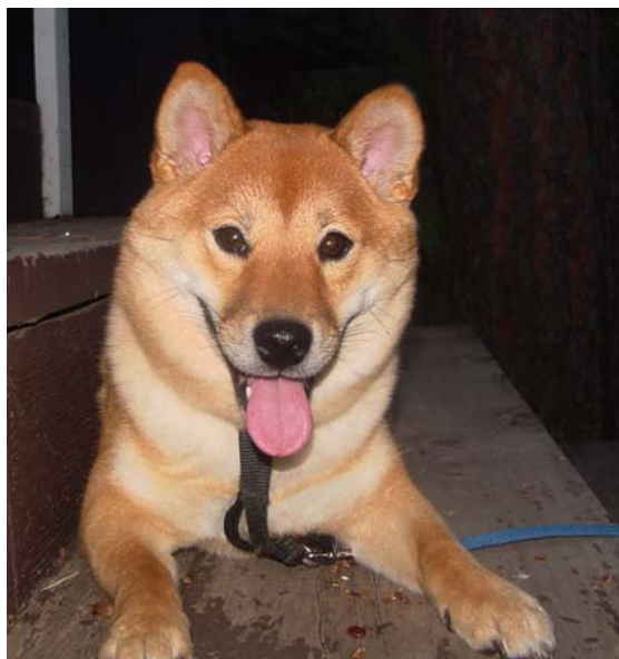
Keep your dog safe - don't let him run loose; keep him leashed on walks; and don't forget to license him with the city.

It is also acceptable to have the dog confined to a crate or confined inside a vehicle for a safe amount of time; however it is pro-