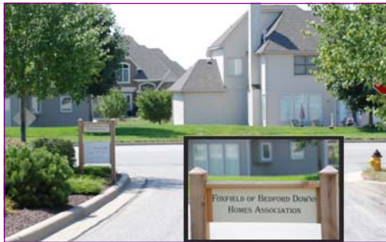
This subdivision sign at Gillette and 123rd Street easily identifies the subdivision (see inset) while doubling as an HOA message board.